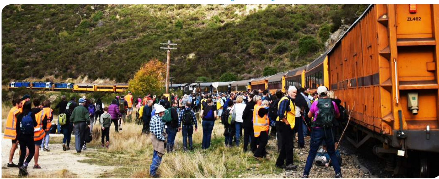
Ready to board the train for the journey home