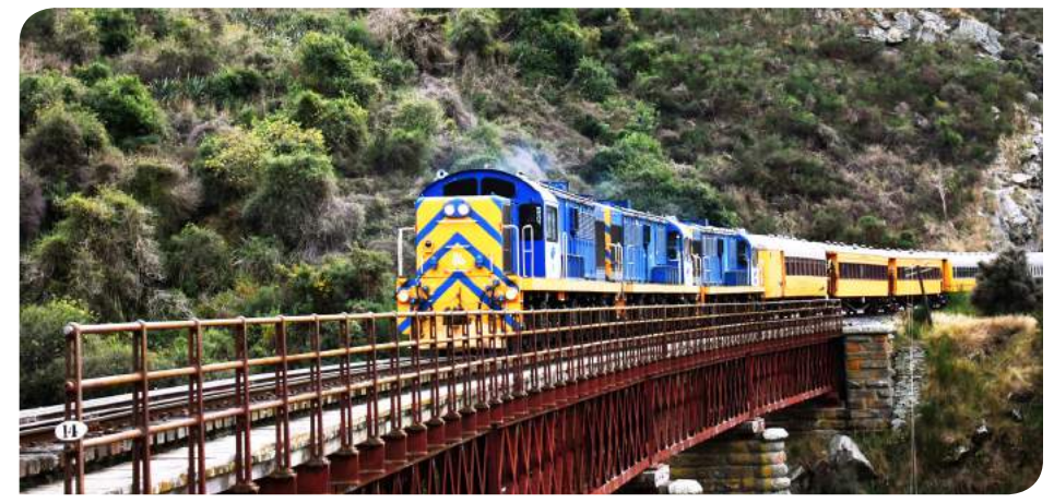
The train heads back through Taieri Gorge