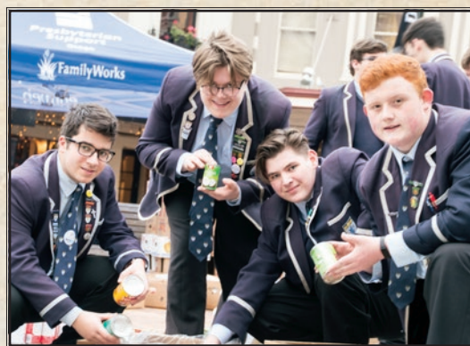
The 2016 harvest...Kings Boys High School students unpack some of the 2100 cans of food they collected for Octacan, our mid-winter can collection in Dunedin's Octagon.