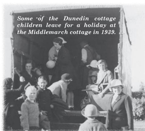
Some of the Dunedin cottage children leave for a holiday at the Middlemarch cottage in 1939.