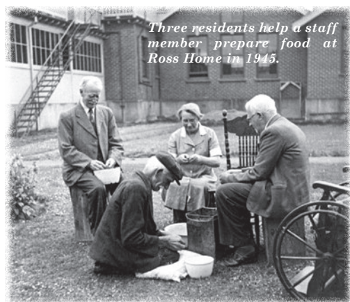
Three residents help a staff member prepare food at Ross Home in 1945.