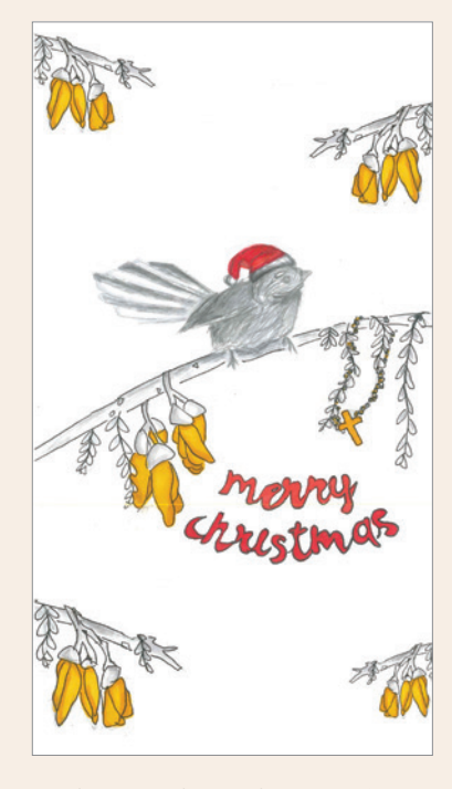
Kowhai Fantail Christmas by Anise Maclean

5. Words in different colour 6. Extra branch at top 7. Extra bird 8. Bird has only one foot