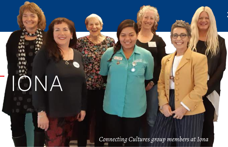
Connecting Cultures group members at Iona

Congratulations to everyone at Iona for this award and for helping to spread knowledge, understanding, awareness and respect for all cultures through the Connecting Cultures programme.