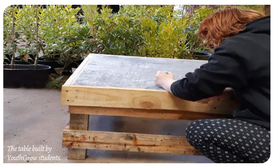
* names have been changed in these stories to protect individual identities.

If you would like to support our young people at YouthGrow visit the nursery at Norwood St, or see them at the Otago Farmers Market each Saturday morning.