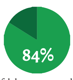
felt better prepared for the future