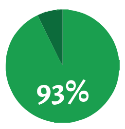
our services were accessible