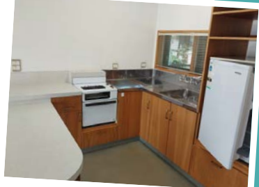
Photo right: A Dalkeith unit includes a private kitchenette and lounge as well as a separate bedroom.

To find out more about Enliven carehomes please visit psotago.org.nz/enliven .