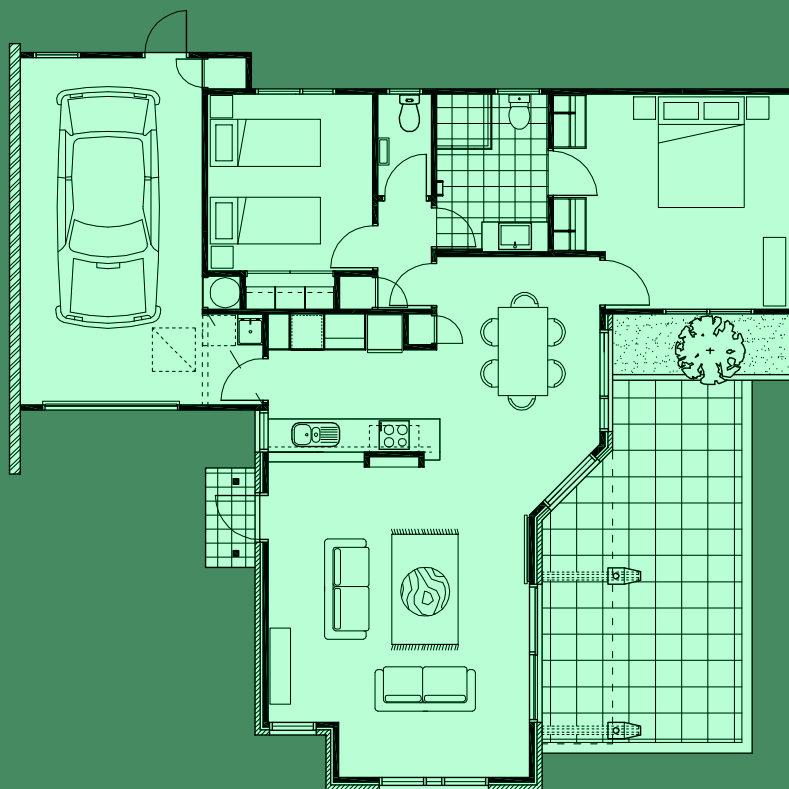
A typical 2 bedroom villa

To enhance the feeling of light and space, the ceilings in the living room and bedrooms follow the steeply raked roofline.